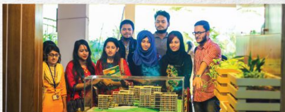
A replica of future CIU campus