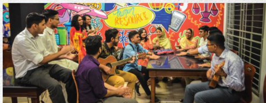
At leisure on campus