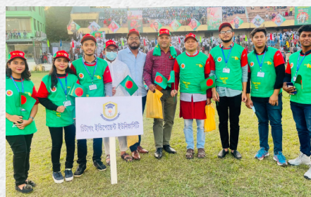
CIU family at Prime Minister Sheikh Hasina's Oath administering program on the occasion of the Victory Day and the Golden Jubilee Anniversary of Bangladesh