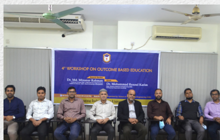
SSE organized a workshop on 'Outcome Based Education' (OBE) on 9 December 2021 at Roksana Manjil, CIU.